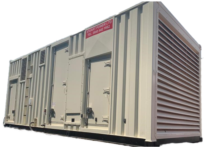
Generator shown is indicative and may not be representative of equipment available at the time.