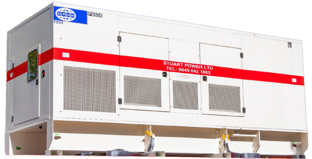
Generator shown is indicative and may not be representative of equipment available at the time.